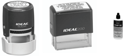
A B C