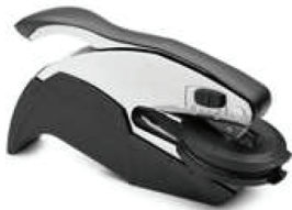
A Complete Seal

★ All inked rubber stamps require re-inking on a regular basis. WARRANTY VOID IF STAMP IS NOT RE-INKED USING APPROPRIATE BRAND OF INK ★ SIZE OF NOTARY STAMPS COMPLIES WITH WASHINGTON STATE NOTARY LAW